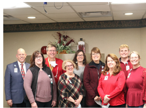
Executive Leadership and Administration