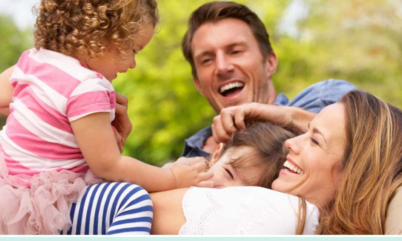
Keeping you well, and feeling good.