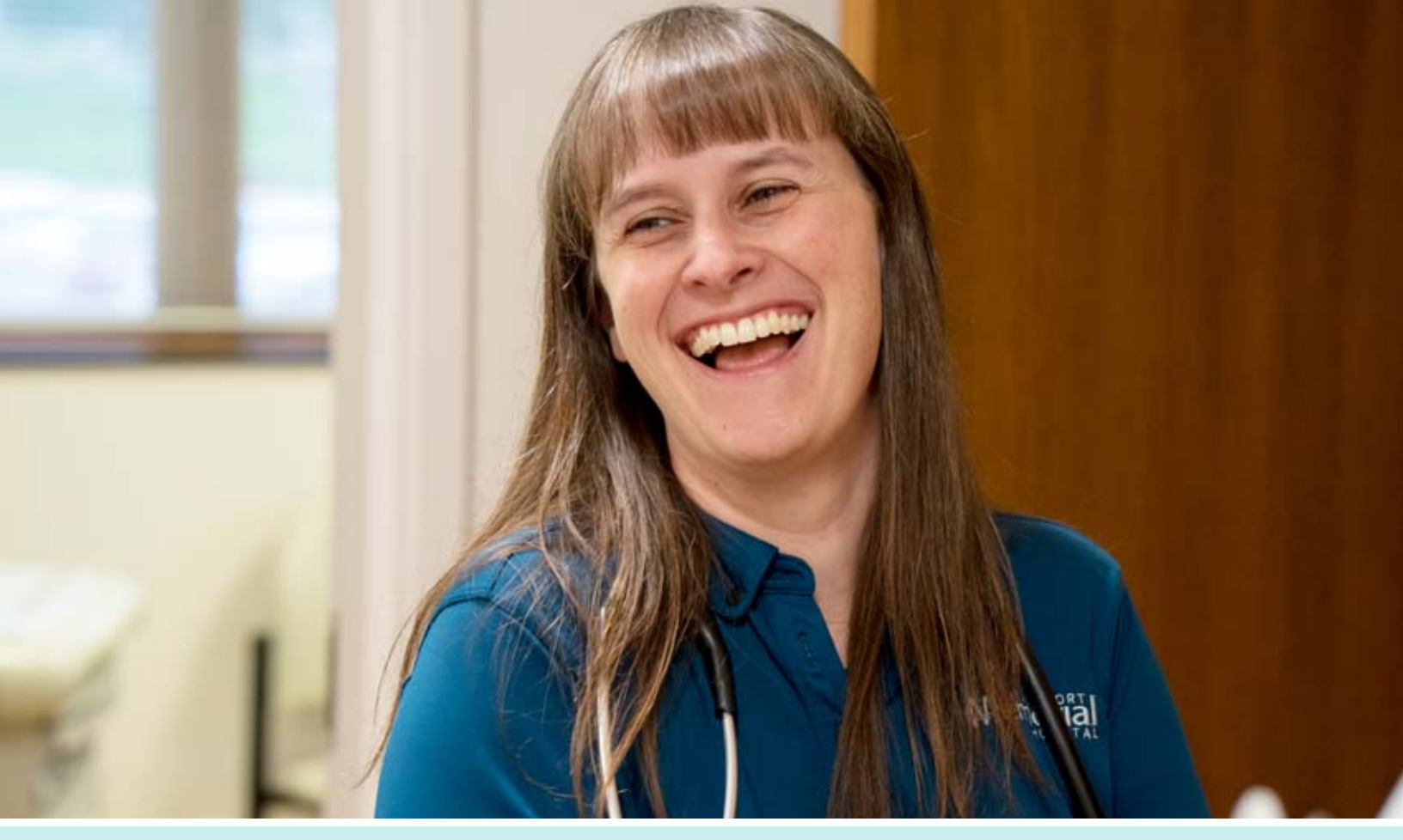
Keeping you well, and feeling good.